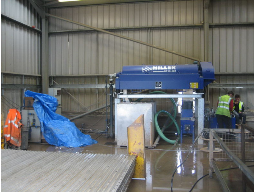
Typical permanent centrifuge installations for recovering solids and muds.

In addition to trial and rental units, MSE Hiller can provide permanent installations which can also be retrofitted into existing sites to supplement existing dewatering capacity.