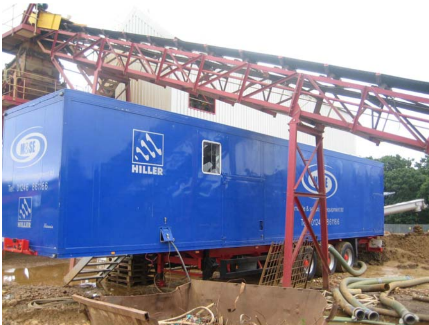
Typical 40 ft trailer mounted mobile processing 30 t/hr of feed material.

MSE Hiller offer mobile solutions which are compact, highly automated, trailer units which require minimal operator intervention with fast hook up times and with the use of modern mobile electrical generators means that they can be used almost anywhere.