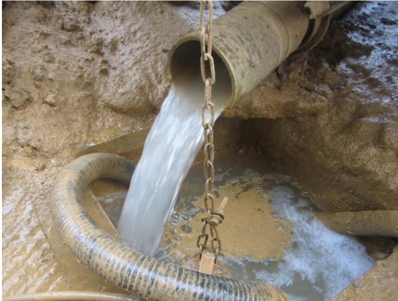
Cleaned water for re-use.

MSE Hiller offer mobile solutions which are compact, highly automated, trailer units which require minimal operator intervention with fast hook up times and with the use of modern mobile electrical generators means that they can be used almost anywhere.