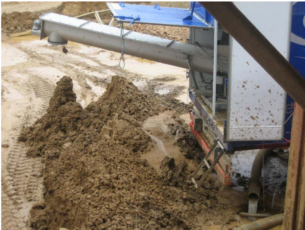
Typical solids discharge

Mobile and Separation Equipment Limited (MSE Hiller), offer a range of mobile and permanent dewatering centrifuges which can process slurry feed flows from 1 to 150 m 3 /hr.